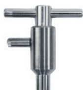
Stainless steel handle for T-Lock system